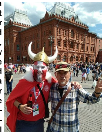
The Danish supporter in question, dressed from head to toe in Denmark red and white!