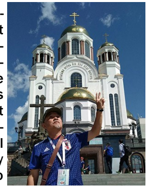
The Ascension (Voznesensky) Cathedral

The next day, I was delighted when I received a CD from a Mexican singer in the lobby of our hotel. We headed to our next tourist destination via the underground subway. There we met with the "Merrymaking" Danish supporter. Even on the train, they continued to dance so wildly that we thought the bottom of the train might fall out. "Good grief"... The heart of politics, culture and religion, surrounded by castle walls on all sides; we had arrived at the long-awaited Kremlin. It was absolutely swarming with tourists, and we were informed that there was a two hour wait for entry. Yet thanks to the ever-clever compatriots that comprised the Three Brave Warriors, entry tickets were somehow acquired. Dashing past the Troitskaya tower, we found ourselves breathing in a peaceful garden area. After seeing the Kremlin, the Cathedral of the Annunciation, the Dormition Cathedral, the Ivan the Great Bell Tower and other landmarks, we had both completed and had our fill of the main attractions of Moscow.