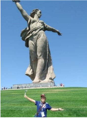
Mamayev Kurgan, also known as "The Motherland Calls"

The following day, we arrived where the third preliminary match against Poland was to be held: Volgograd. A town that stretches north-south along the great Volga River, seeing the day's weather gave us expectations of a climate akin to Japan on a mid-summer's day; we were greatly mistaken, once more making us painfully aware of Russia's enormity. We went to see Mamayev Kurgan (The Motherland Calls), and were taken aback by its sheer