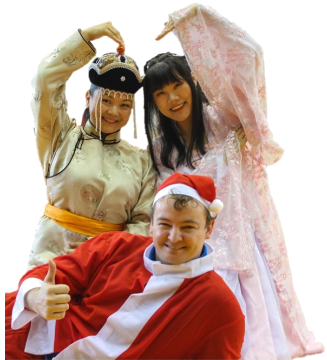
We look forward to having you with us for our next Trivia Night!

For those that manage to write a particularly popular piece, there might even be a special prize...? You'll have to wait and see! There will definitely be gifts for