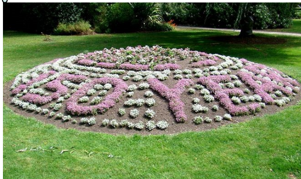
150 Year celebration for Colac Botanic Gardens