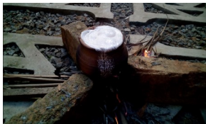
Boiling milk over the hearth

that marks the New Year for Sri Lanka. The exact date that this occurs varies from year to year, but is generally near to the middle of April. This year, in Sri Lankan time, our New Year begins Thursday April 14th, at 8:41:17AM. When it comes time to greet the New Year, it is customary to place a clay pot on the hearth, add milk to the pot, and boil the milk. It is said that it is good luck for the milk to overflow as you enter into the New Year.