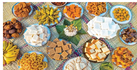
A typical table spread after exchanging snacks

This year marks my 6th year since coming to Japan as an exchange student, and hence New Year's Day has passed six times as well. All of these things feel very nostalgic.