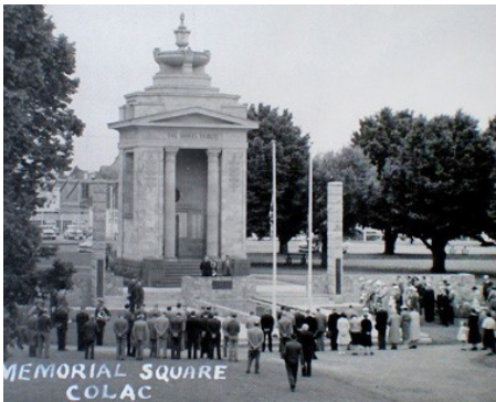
Colac Memorial Square, both when it was built, and now.