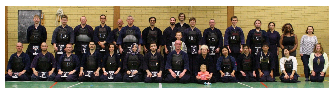
Shudokan Dojo group photo, taken after a regional tournament in Cheltenham, England.