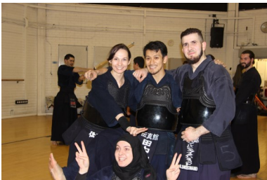
Farewell practice for an swords and crossing International student and teaching returning to Fukuoka.

but now this resonates with me a lot. Kendo has allowed me to travel all around the UK attending competitions and seminars and now that I am in Japan, I have joined my school's Kendo club, helping me build some better connections with my students. Kendo has helped me grow as a person, giving me more confidence to try new things and push myself to get better. It also doesn't hurt that it is a great way to exercise, certainly beats running a few km on