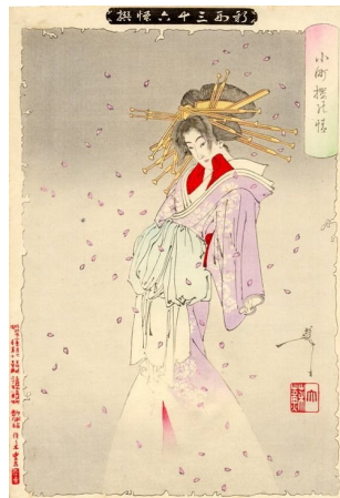
Two Tsukioka Yoshitoshi prints: Left, Minamoto-no Ushiwakamaru Battling with Kumasaka (1883). Right, The spirit of the cherry tree (1889).

Yoshitoshi is most famous in the west for his depictions of ghost stories; far from appalled by western influences, Yoshitoshi embraced them. Yoshitoshi had learned elements of western style drawing, techniques and perspective through studying his master's collection of foreign prints and engravings. This gave his prints a different style from the traditional Ukiyo-e's. His prints have energetic poses and realistic details.