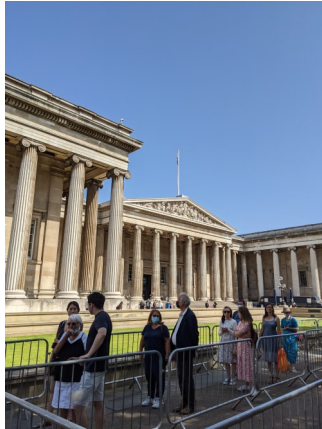
The main entrance to the British Museum in Holborn London.

Tsukioka Yoshitoshi quickly became my favourite woodblock artist, or "Ukiyo-e" artist. He lived and worked at the end of woodblock printing era (as thought by some), working against fast cheaper western methods that were starting to appear in Japan at the end of the Edo period.