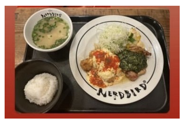
The aforementioned chicken nanban, moments before being happily consumed!