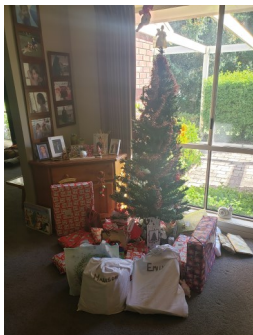
Plenty of presents under the tree!

Once everyone is seated at the dinner table, there's one last thing we do during the course of the meal: open bonbons! For those that haven't seen or used a bonbon before, here's a brief explanation. Everyone at the table will have a bonbon, which looks like a colourful cardboard tube with a middle and two side pieces, placed next to their dinner plate. You and the person sitting next to you pull on either side of the bonbon, and it opens with a 'BANG!' In the middle, you will find a hat, a small toy, and a truly terrible joke to share with everyone at the table. No one really knows how this became a tradition, but it's a fun way to start the meal! Eventually, once the evening meal has concluded, everyone gradually says their farewells and heads back to their own homes; the household that was just a moment before a bustling, cacophonous hive of activity returns to its usual stillness. Over the course of the next week, this repeats a number of times as we visit all of our extended family who live in Victoria.