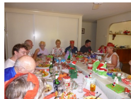
Everyone gathered for the Christmas meal, with some bonbons (right) to make it festive!

Christmas Day begins with presents from under the Christmas tree being handed out to everyone, before a generous Christmas lunch is served. Afterwards, all of the extended family who live nearby will converge on one house; this is typically our house, as we usually have the most guests present already. If we get all of the aunts, uncles, cousins and grandparents together, we have just short of 30 people in one house for Christmas dinner! This dinner