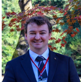
This photo was taken during a Challenge Video shoot!

I've also been lucky enough to experience and take part in a variety of events, from local festivals to MIA's premiere events, World Festa and the World Beer & Trivia Night. Within my first month in Miyakonojo, I